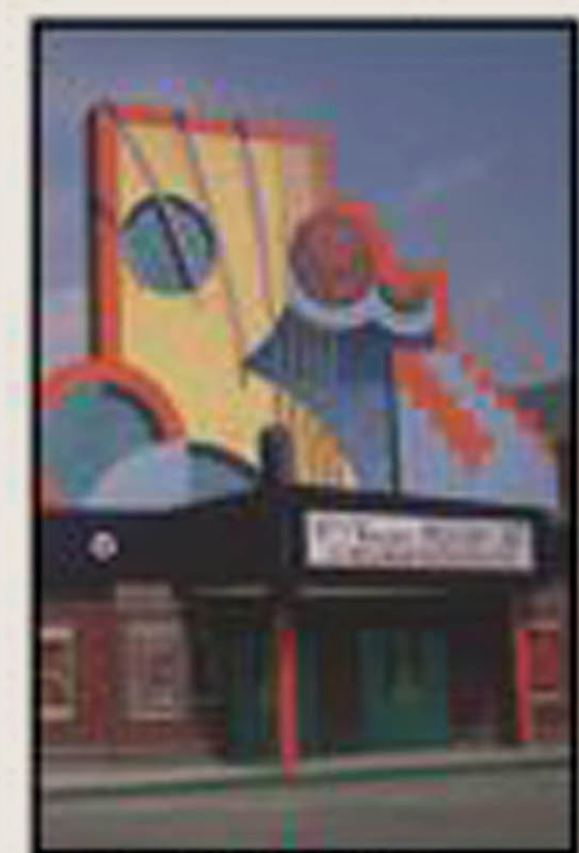
MASTERPIECE: Still stirs controversy

TOKYO STOCKS UP: averaging a 5 point increase in rally. Section C.