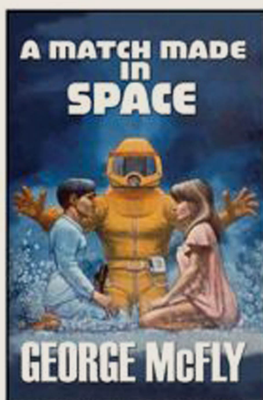
1985 CLASSIC SCIENCE FICTION NOVEL. A Match Made in Space, was written by George McFly

the best science fiction novel of the decade, and its stature has only increased over the years. I had a lot of meetings back in the day, only to be told that no one thought I could handle a film with a lot of special effects," says the director, whose latest production, The Walk, is currently garnering rave reviews from critics and audiences alike. Zemeckis' perseverance in his pursuit to direct his dream project stems from his own personal philosophy. "I've always said, if you put your mind to it, you can accomplish anything." The original 1989 release was considered a creative misfire as well as a box office bomb, and for