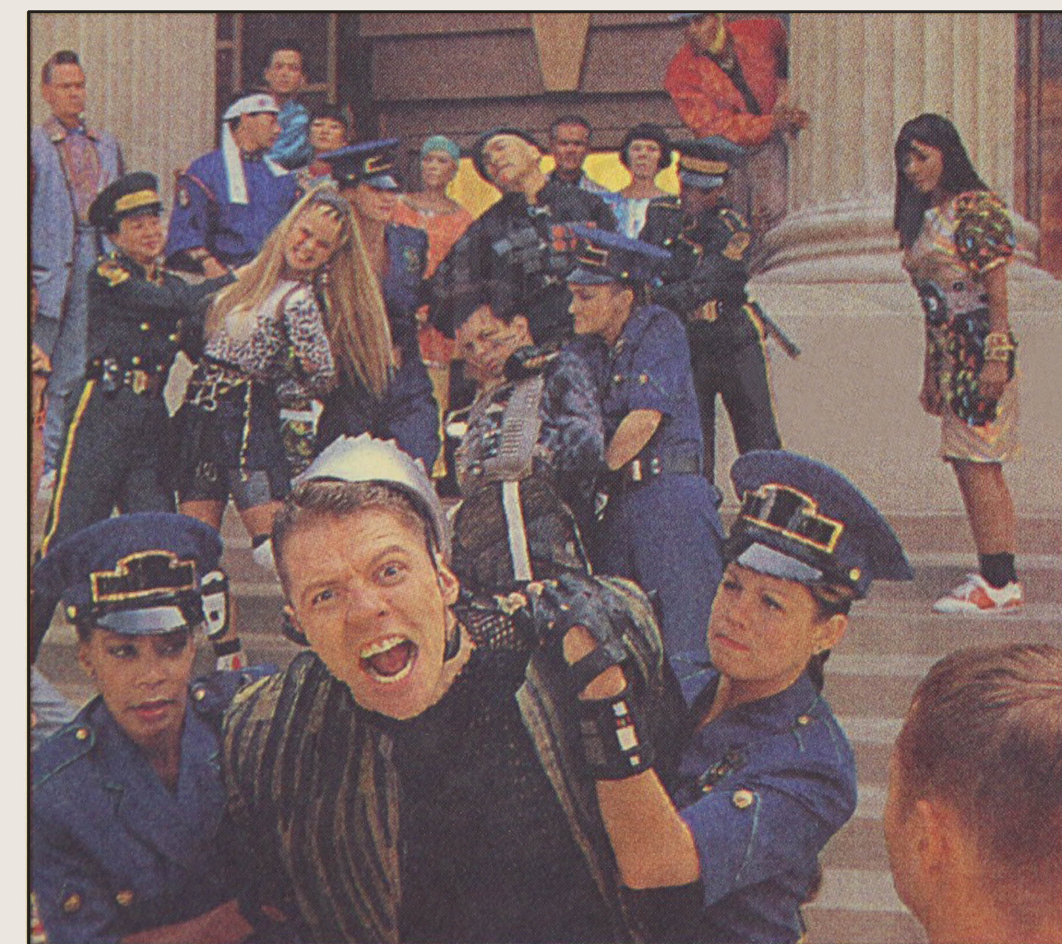
Gang Leader had Bionic Overloads